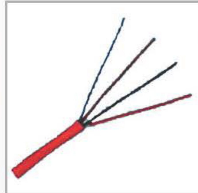
Fire Alarm Cable