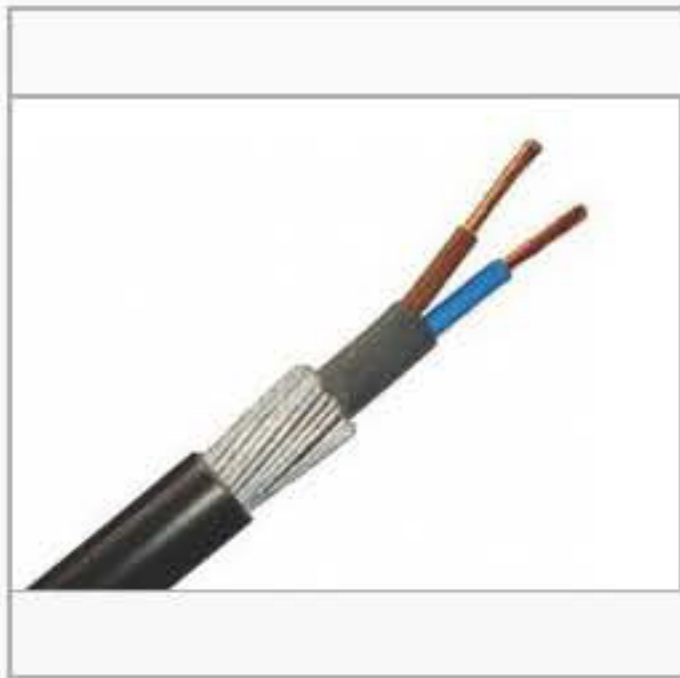
Shielded & Armoured Cables