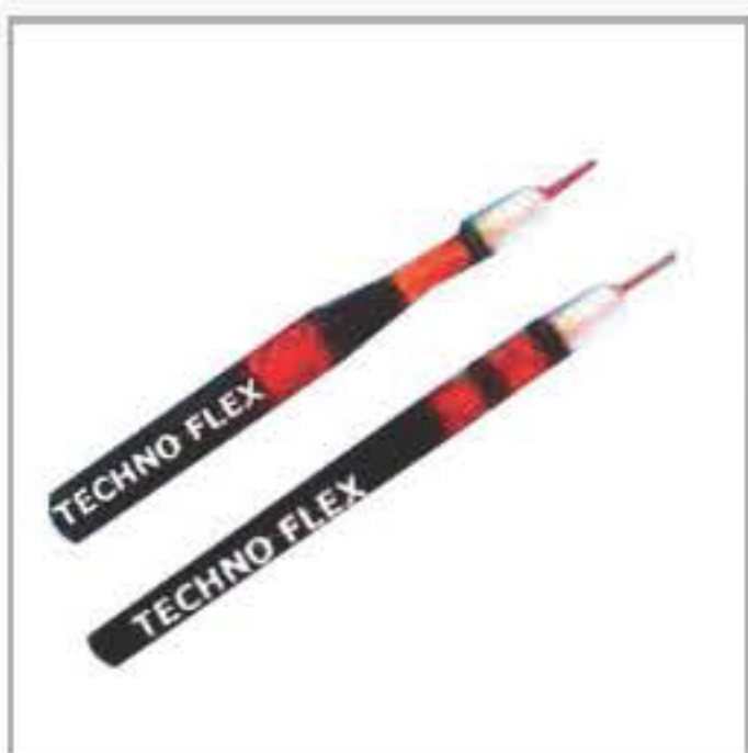
Coaxial VSAT Cable