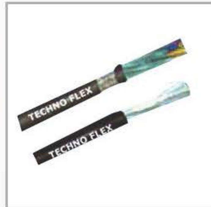
General Instrumentation Cable