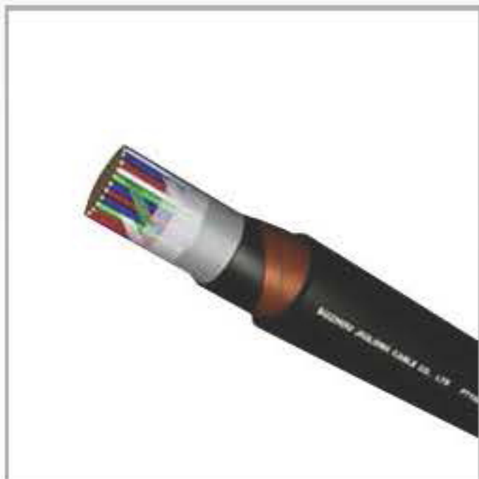
Insulated Signal Cable