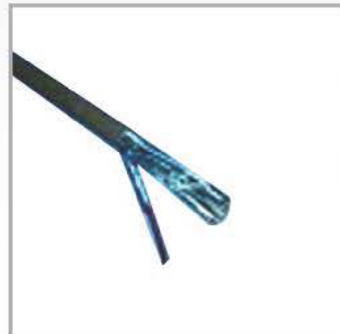
Aluminium PCM Cable