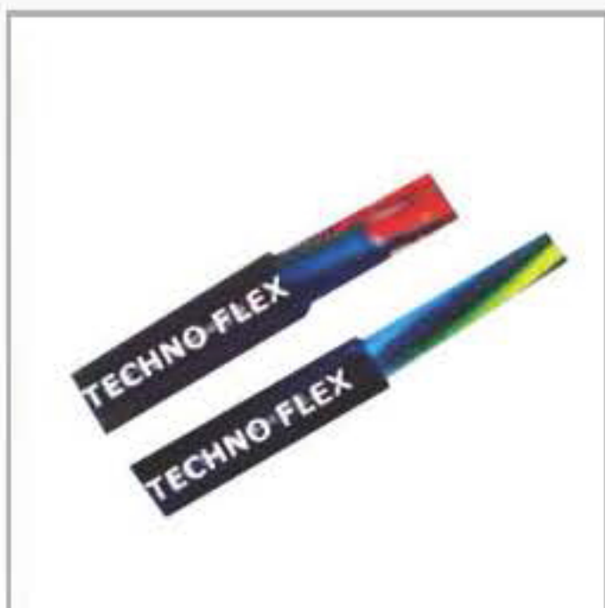
Multipurpose Flexible Cable