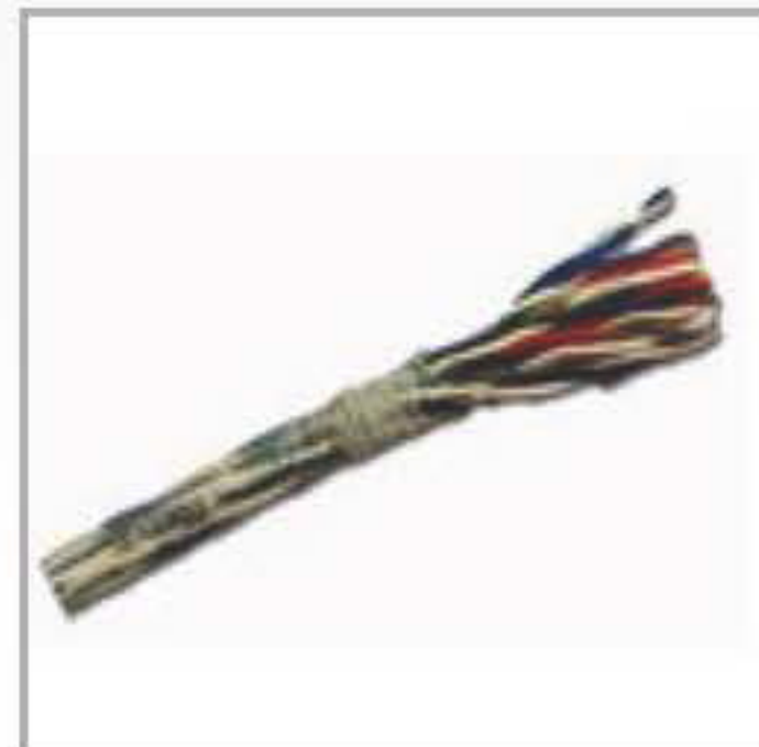
Insulated Electrical Cables