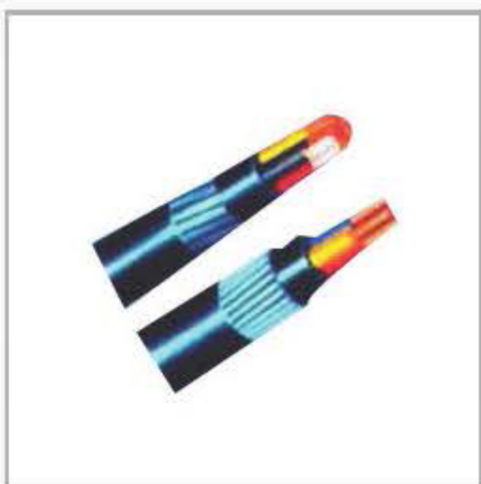
Electric Power Cables