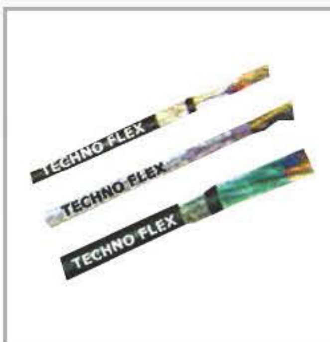
Flexible Screen Cables